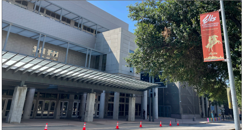
The 2024 Elks National Convention is being held at the Austin Convention Center.