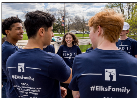
The Top 20 scholarship winners visited Chicago and spent three days networking, serving others, and learning about the Elks.

The scholars began their first full day with a visit to the Elks National Veterans Memorial and Headquarters. They got to see the ornate