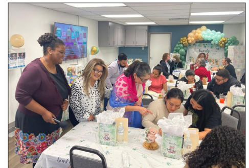
Gonzales, TX Lodge No. 2413 hosted a community baby shower with funds from a Spotlight Grant.

With its Spotlight Grant, Gonzales, TX Lodge No. 2413 hosted a community baby shower. Expectant mothers and community leaders listened as nurses gave tips about pregnancy, and Members of the Lodge shared information about the Elks. The presentations were delivered in both English and Spanish.