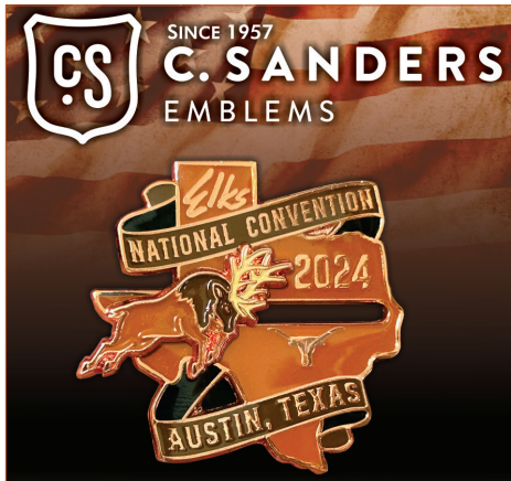
Convention Pin at Booth #314