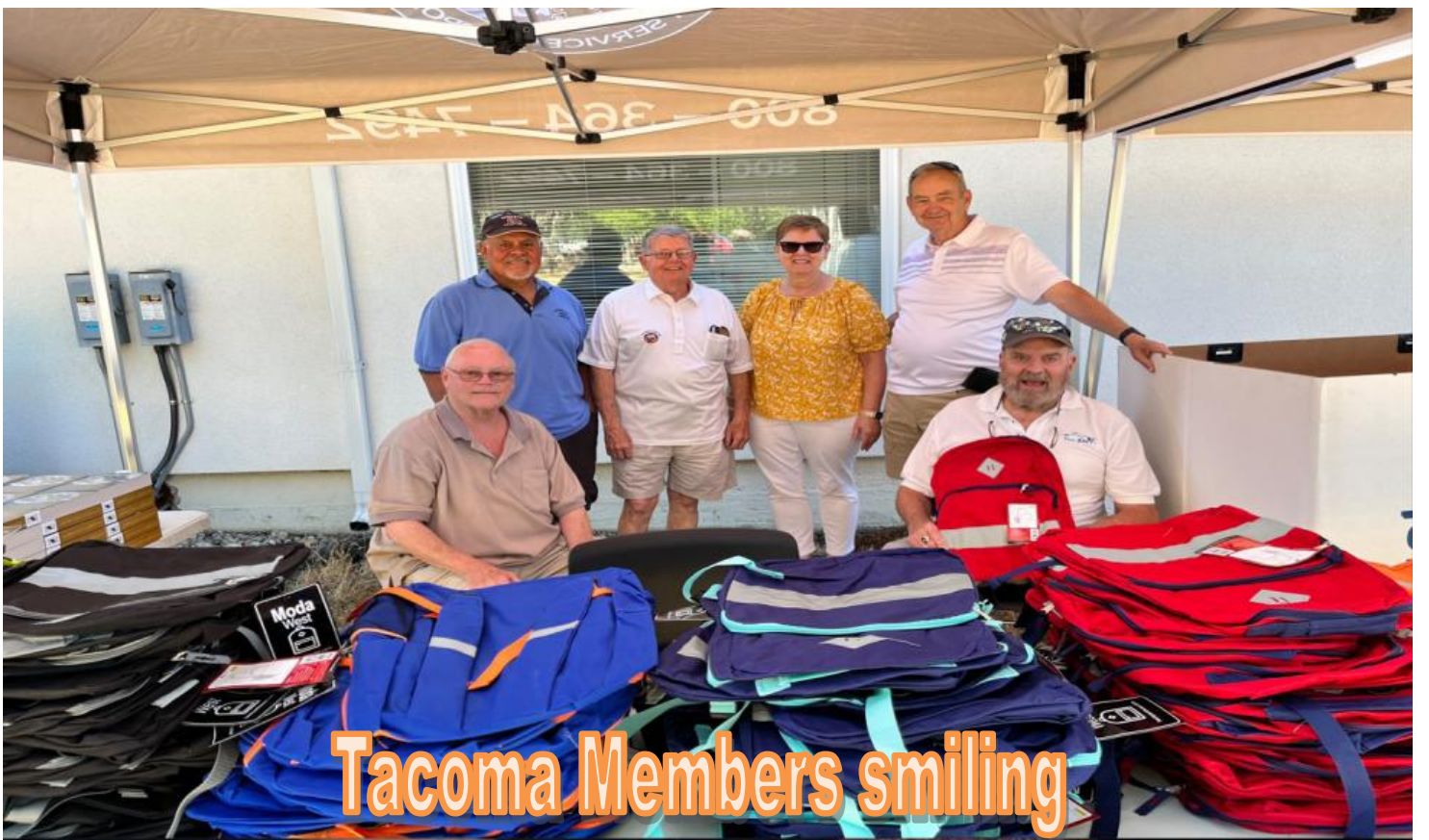
Tacoma Members smiling