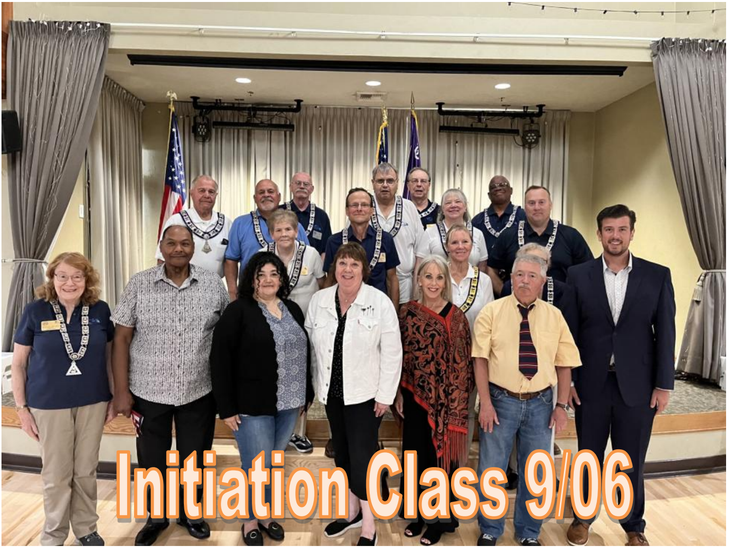
Initiation Class 9/06