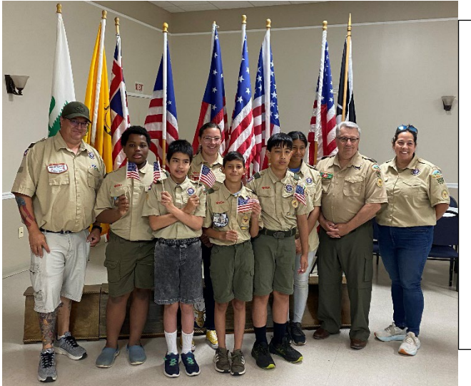
Thank you to the Boy Scouts, Officers, and Members who came out to recognize Flag Day!