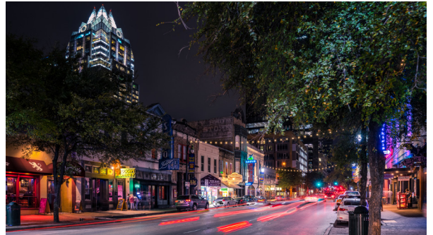
Sixth Street in downtown Austin

Another of Austin's outstanding features is its live music scene. Many well-known music venues are located downtown on Sixth Street. Other notable venues include the low-key Cactus Cafe, located on the campus of the University of Texas; the spectacular Paramount Theatre, which boasts the decor of an old-fashioned movie palace; ACL Live at The Moody Theater, home to the popular Austin City Limits television show; and the Elephant Room, a renowned jazz club.