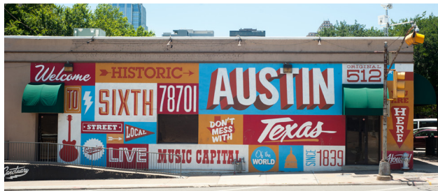
Historic Sixth Street Mural