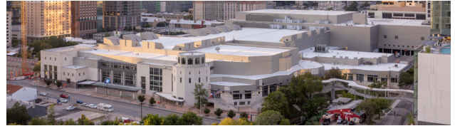
Austin Convention Center

Displays for the activities of Grand Lodge committees and programs, state major projects, and trademark licensees will be in the Austin Convention Center in Hall 2.