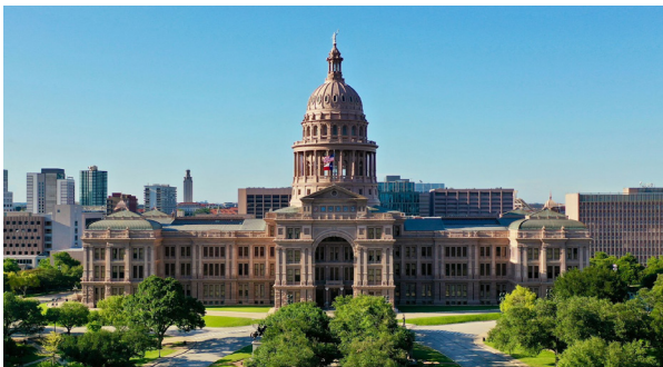
Texas State Capitol in Austin

Austin is home to many museums and cultural sites, and one of the most recognizable landmarks is the Texas State Capitol, located at 1100 Congress Avenue. The capitol was constructed between 1885 and 1888 within 22 acres of landscaped parkland and is based on the design of Italian Renaissance buildings. The building is open to the public for guided tours that pass through many of its most important spaces.