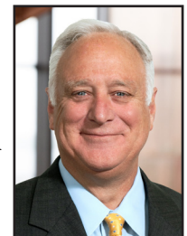
Mayor Kirk Watson City of Austin