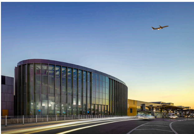
Austin-Bergstrom International Airport

Departure plans should be made accordingly. Late checkouts should be arranged with individual hotels in advance.