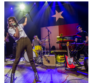
Live music at ACL Live