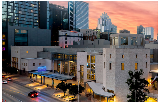
Austin Convention Center