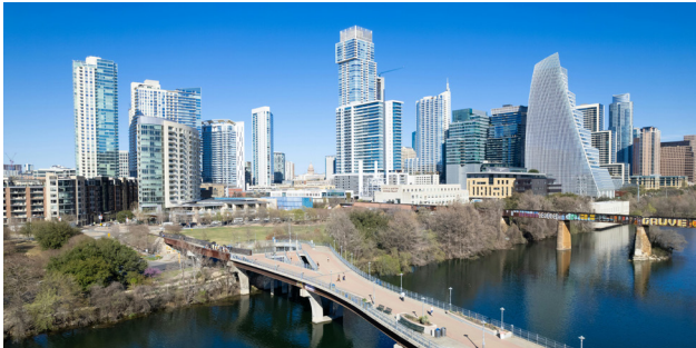
Austin’s skyline and the Colorado River

The registration area will open on Friday, June 28, at 12:00 p.m. at the Austin Convention Center. The registration staff will be available during the convention to address any issues with badges or voting credentials. The Austin Convention Center should be considered your information center.